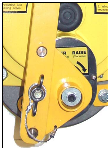
Handle Position 1