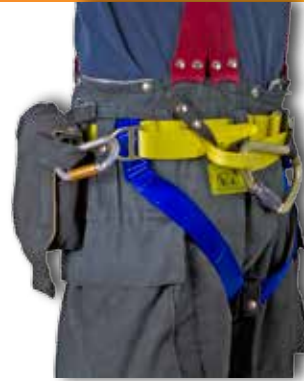
Shown with 556 Hip Bag for Escape System