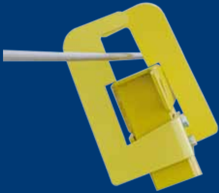
HL3-IA Pass Through Adapter