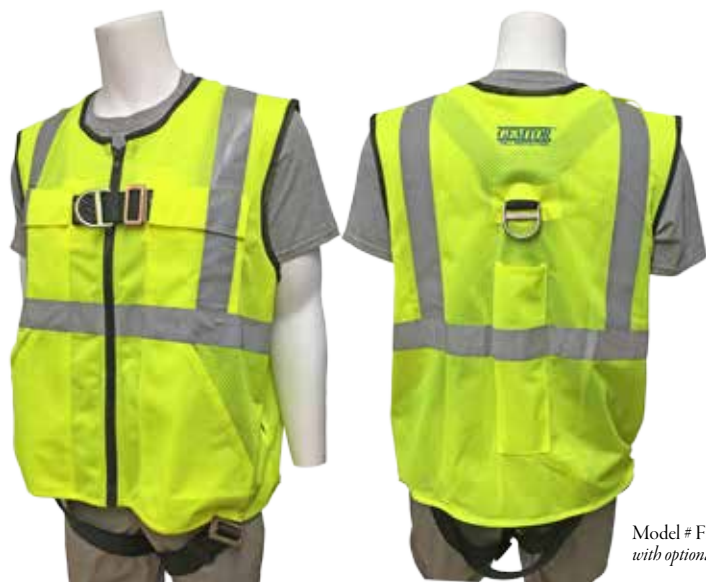
Model # FPV-MFD-2 Shown with optional front D-ring