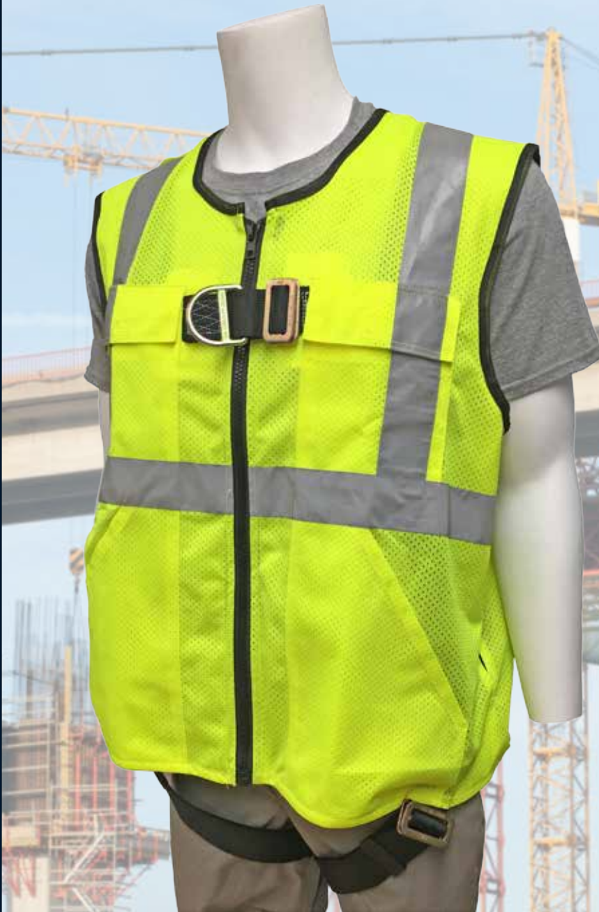
Shown with optional front D-ring