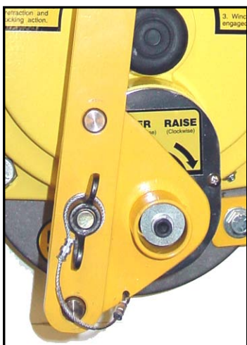
Handle Position 1