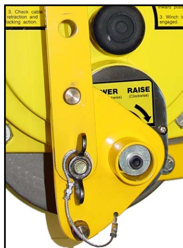
Handle Position 2